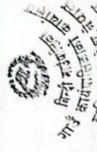
Final Report: Nisfi Rural Municipal Transport Master Plan (2081) Annex 1: List of Rural Municipal Road Core Network (MRCN)